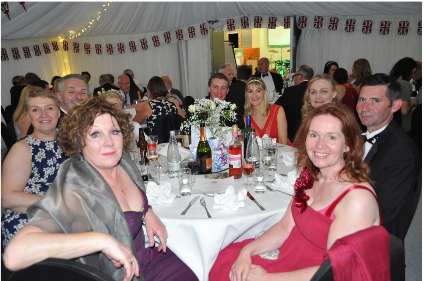
Report p3.