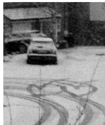
Love in the snow – down St Thomas's Way.