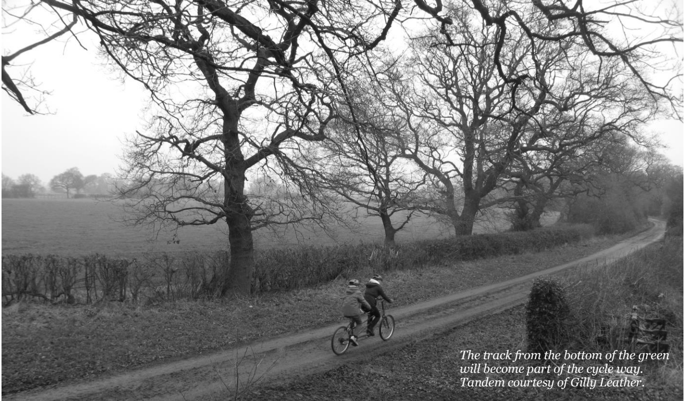
The track from the bottom of the green will become part of the cycle way. Tandem courtesy of Gilly Leather.